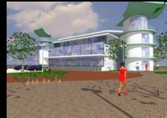
Hotel, Ryde, Isle Of Wight

We are committed to getting it right time after time, meeting deadlines and keeping promises