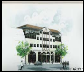
Hill Street Hotel