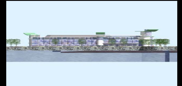
Hotel, Isle Of Wight