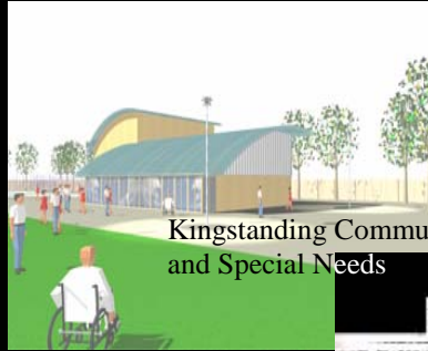
Kingstanding Community Youth and Special Needs