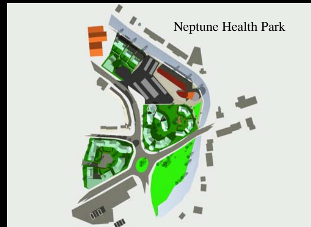
Neptune Health Park

We are committed to getting it right time after time, meeting deadlines and keeping promises