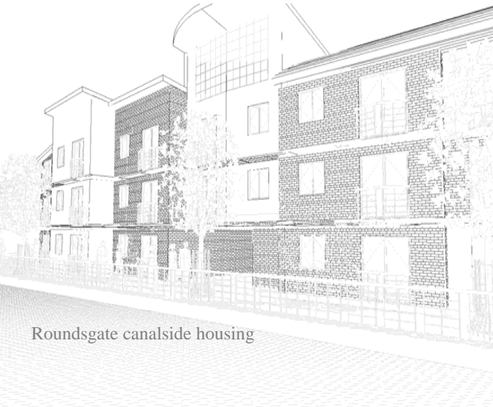
Roundgate canalside housing

The very best of constructional techniques, materials usage and sustainable environmental practice. Architectural solutions that are an inspiration to users and provide Clients with buildings that exceed their expectations. Buildings that stand the test of time.